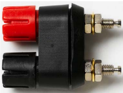
Model 6884 Dual Binding Posts with Raised Base